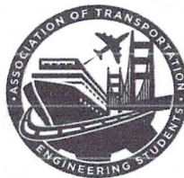
ATEs - Association of Transportation Engineering Students