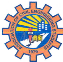
ACES - Association of Civil Engineering Students