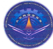
AEROESS - Aerospace Engineering Students' Society