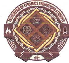
ACerES - Association of Ceramics Engineering Students